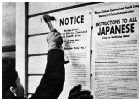
Soldiers and police posted President Roosevelt's February 19, 1942 Executive Order #9066 requiring the expulsion of Japanese Americans from the West Coast. Posters included euphemisms like "evacuation" and "Assembly Centers".