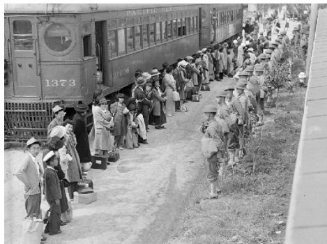
Japanese Americans from San Pedro, California, guarded by soldiers arrive at Santa Anita Race-track, a temporary detention center, in Arcadia, California, in 1942.

Definitions —a euphemism is “a mild word or expression substituted for one considered blunt and embarrassing” (Chantrell, 2002, p.186). It comes from the Greek euphemismos, from euphemizein ‘use auspicious words’. The formative elements are eu “well” and pHEME “speaking” (English usage since late 16th century) (Chantrell, 2002). In more modern times, author William Safire (1981) writes: “To some degree, euphemism is a strategic misrepresentation” (p. 82).