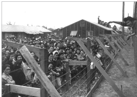
Japanese Americans behind the barbed wire fence in Santa Anita Race Track, a temporary detention center, waving goodbye to friends leaving by train for other incarceration camps.