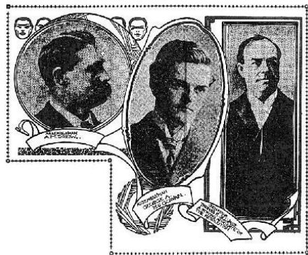
Headline from the San Francisco Chronicle on March 3, 1905.

While many of the 19th century Japanese visitors to the U.S. were sojourners seeking adventure, education, and even economic opportunities, little did they anticipate that if they decided to stay permanently in this country, any move towards naturalization would be barred by an Act of Congress passed in 1790, which allowed only ‘free white men’ to be naturalized (Chuman, 1976). The Chinese Exclusion Act of 1882 aided (by favoring) Japanese immigration to America, but not for long (Takaki, 1989). In early 20th Century, California passed its Alien Land Law (1913), which used the indefinite alien status of Japanese and other Asians to prevent them from acquiring real estate, and setting down permanent roots. The California law was soon mimicked by other western states (Chuman, 1976). Japanese and other Asian immigration was finally turned off by the passage of the U.S. Immigration Exclusion Act of 1924. Japanese immigration was halted until the 1952 passage of the McCarran-Walter Act. This historic act allowed Issei (Japanese immigrants) to become naturalized for the first time and allowed immigration to resume (at 185 Japanese persons per year), now without constraints to a person’s country of origin (Maki, Kitano, & Berthold, 1999).