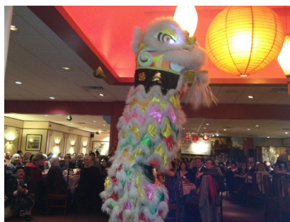
The Shaolin Hung Mei Kung Fu Academy of Boulder