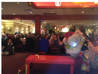
The Shaolin Hung Mei Kung Fu Academy of Boulder

gong xi fa cai - Happy New Year in Mandrin