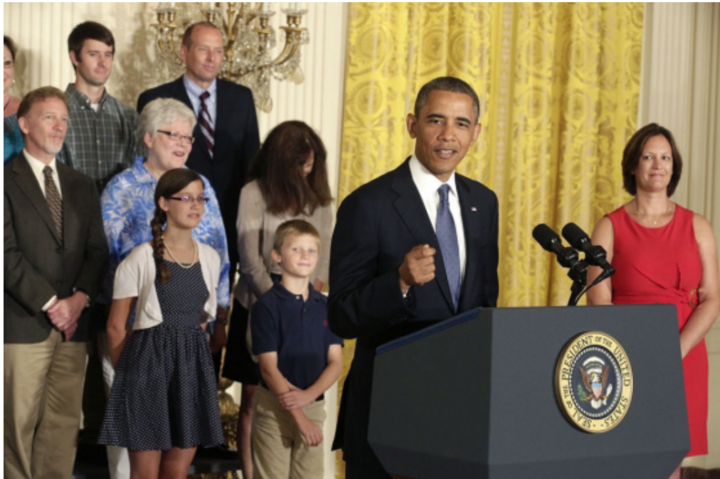
President Obama briefs an audience on the Affordable Care Act

Information on the Affordable Care Act will be available at the JAACL National Convention at 10:30 a.m. on Thursday, July 25, in Meeting Room 7 at the Renaissance Hotel, 999 Ninth Street N.W., Washington, D.C. For further information, visit http://jaacl.org/2013/schedule