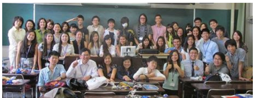
Kyoto Kakehashi group at Doshisha University.