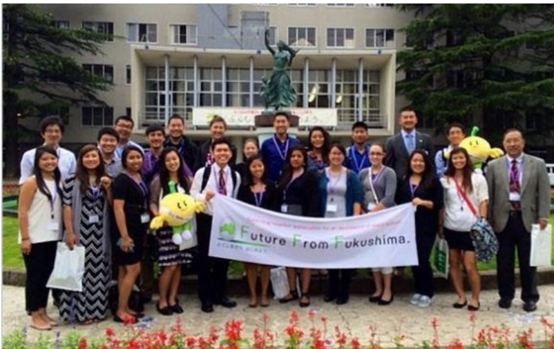
Fukushima Kakehashi group at Fukushima University.

Both groups have returned to Tokyo where they will stay until the end of their trip on July 24. In Tokyo, the Fukushima and Kyoto groups will visit Toyo University and Meiji Gakuin University, respectively, in addition to touring the Diet Building, Japanese Overseas Migration Museum, and the Miraikan National Museum of Emerging Science and Innovation, among other activities. Follow JACL National on Instagram @JACL_National, and Facebook to see pictures of the July Kakehashi trip that is still going on now!