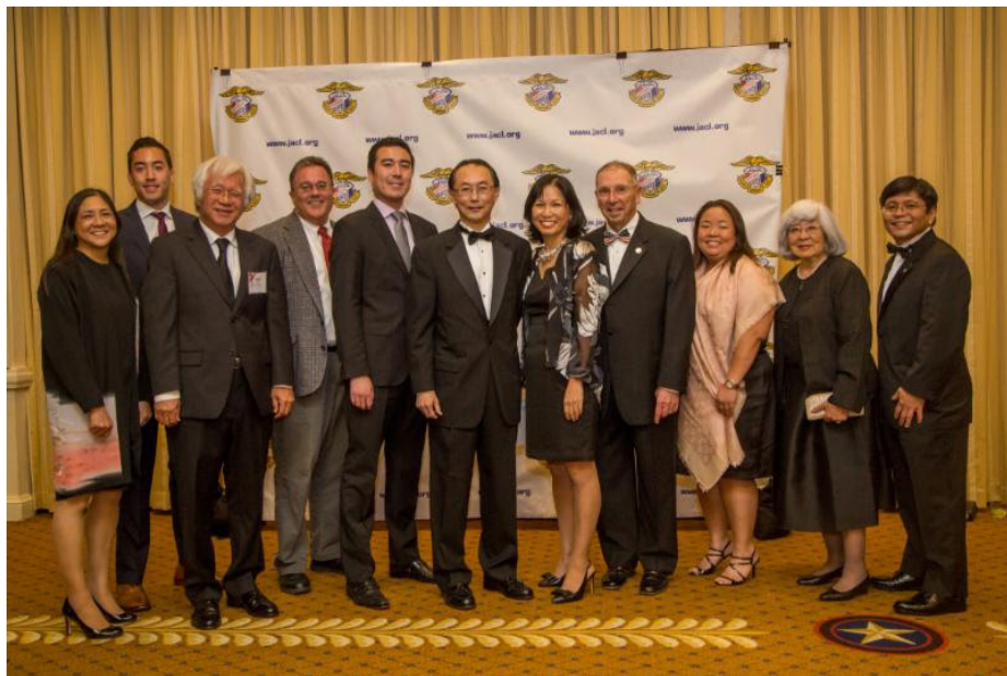
JACL National Board Members and Executive Director