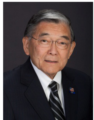
Secretary Norman Y. Mineta to receive Lifetime Achievement Award at the NJAMF Gala.

The National Japanese American Memorial Foundation (NJAMF) is a nonprofit organization dedicated to education and public awareness about the Japanese American experience during World War II. NJAMF raised the private funds to build the Japanese American Memorial to Patriotism. The Memorial is not only a monument to the Japanese American experience, but also a reminder that we must not allow anything like this to happen to any minority community again. www.njamf.com