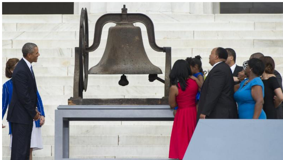
Wednesday, August 28, 2013 - 50th Anniversary of March on Washington